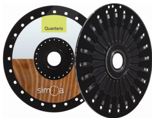
Figure 2. Simoa disc containing 24 array assemblies arranged radially. Each array contains 216,000 femtoliter-sized wells, which can contain individual beads with or without an associated immunocomplex.

with oil and imaged. Simoa permits the detection of very low concentrations of enzyme labels by confining the fluorophores generated by individual enzymes to extremely small volumes (~40 fL), ensuring a high local concentration of fluorescent product molecules. If a target analyte has been captured (that is, an immunocomplex has formed), then the substrate will be converted to a fluorescent product by the captured enzyme label (Fig. 3). The ratio of the number of wells containing an enzyme-